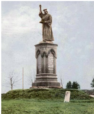
Erected 1862 - Destroyed 1949

Today, the 2021 National Census shows Christian affiliation of any kind is only 26% of the population. Lutherans make up 11% of that number. Home of Hope - Tartu Academy is working to change these statistics and reclaim both their country and beyond its borders for Jesus Christ. Home of Hope ministries in Tartu, Estonia includes a Bible School, Christian Radio which reaches Estonia, Eastern Europe, and portions of Russia, and many other Christ focused, Christ driven missions.