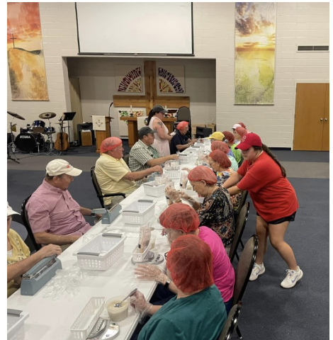
Photos from the 2023 Packing Event